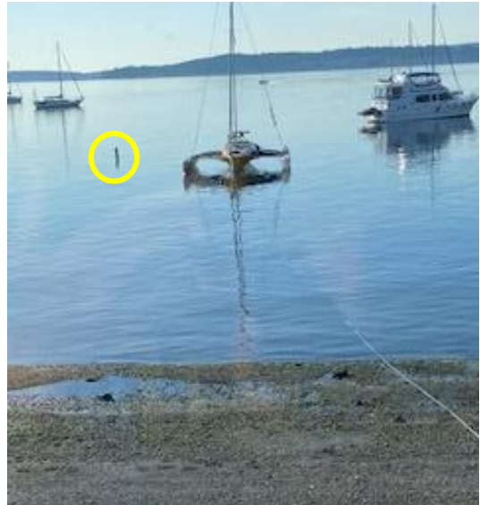
Figure 3. Catamaran appearing to be anchored within the Port Townsend No-Anchor Zone (buoy circled in yellow), but with its anchor placed high up on the shore.

Two additional monitoring efforts were recorded by MRC members, Sarah, on 9/9/2023 and Neil and Brent on 9/10/2023 during the Wooden Boat Festival, bringing the total to 28 monitoring days. On 9/9/2023, Sarah noted a yellow catamaran anchored within the no-anchor zone near Better Living Through Coffee. Upon closer observation, Frank reported that the boat was instead anchored high up the shore, seeming to not disturb the nearshore vegetation (see Figure 3). See monitoring photos taken by Brent on 9/10/2023 in Figures 4-6 and vessel count data sheets attached at the end of this report. No boats were observed to be anchored within the boundaries of the buoys, even during the Wooden Boat Festival which attracts hundreds of boats and thousands of visitors to Port Townsend Bay. This resulted in 100% boater compliance with the Port Townsend eelgrass protection no-anchor zone this year.