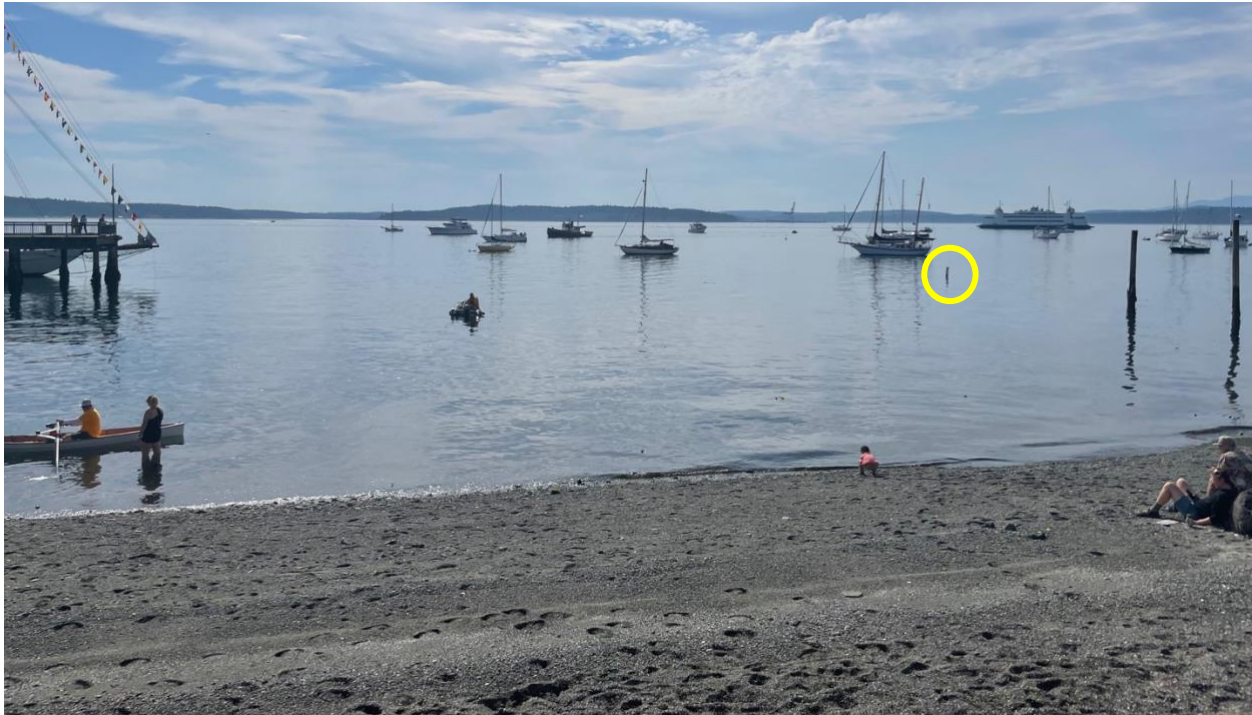
Figure 5. Photo of anchored vessels in compliance with the eelgrass protection no-anchor zone (buoy circled in yellow) during the Wooden Boat Festival (9/10/2023), by Brent Vadopalas.