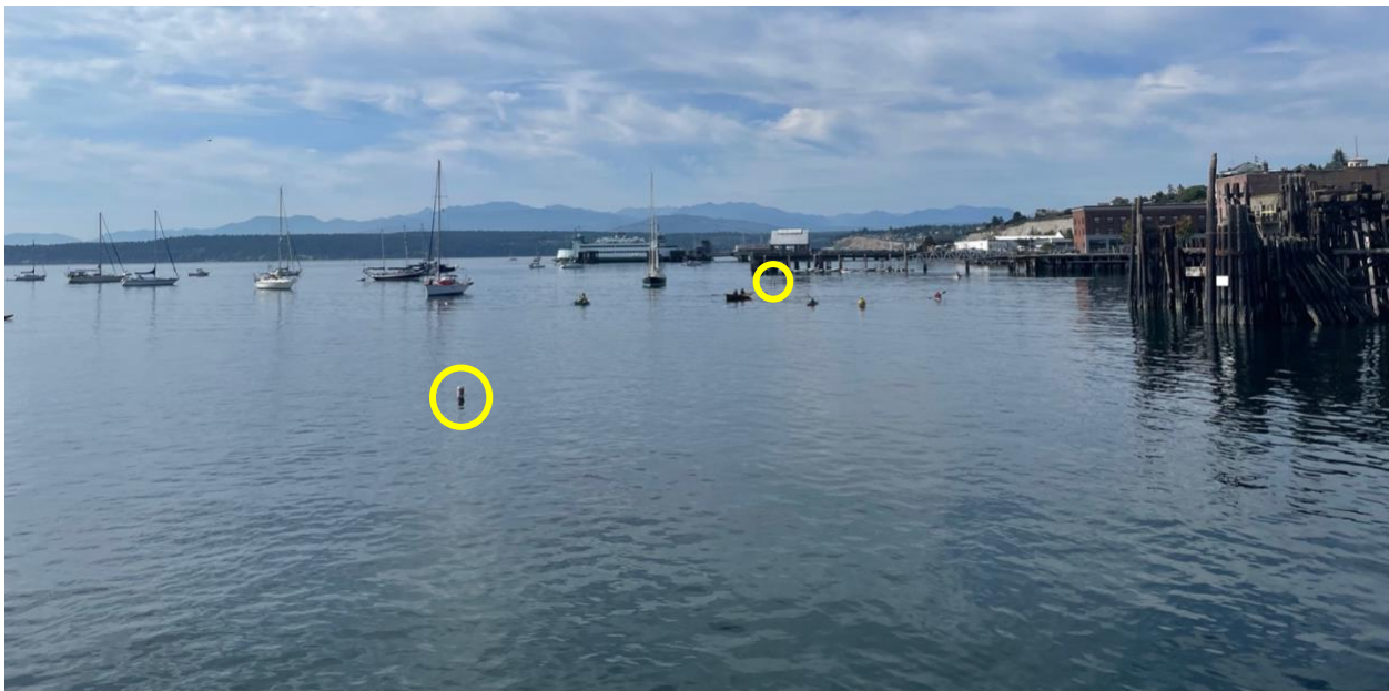
Figure 4. Photo of anchored vessels in compliance with the eelgrass protection no-anchor zone (buoys circled in yellow) during the Wooden Boat Festival (9/10/2023), by Brent Vadopalas.