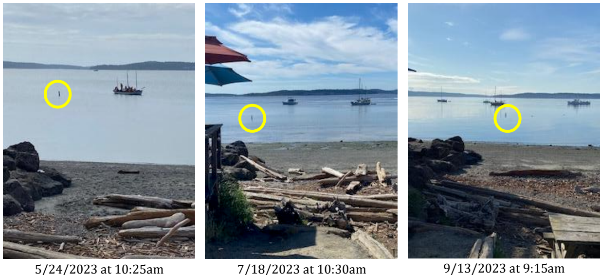
Figure 2. A sample of photos taken by MRC member, Frank, documenting vessel compliance with the Port Townsend No-Anchor Zone (buoys identified with yellow circles).

One MRC member, Frank, diligently monitored the Port Townsend buoy field between October 8 and September 22, with a total of 26 monitoring days recorded. Frank typically monitored from the viewpoint near Better Living Through Coffee, with a couple of observations taken from viewpoints near Adams Street Park and the NW Maritime Center dock, and typically in the mornings, with a few monitoring times recorded in the late afternoon (see Table 1). See a sample of Frank's photos documenting compliant boaters in Figure 2.